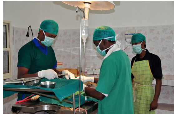
aseptic flank surgery

No. of ABC operations : Dogs – 342, Cats - 78 No. of AR vaccinations : 1159 Expenditure on operations : Rs. 2,76,592/-