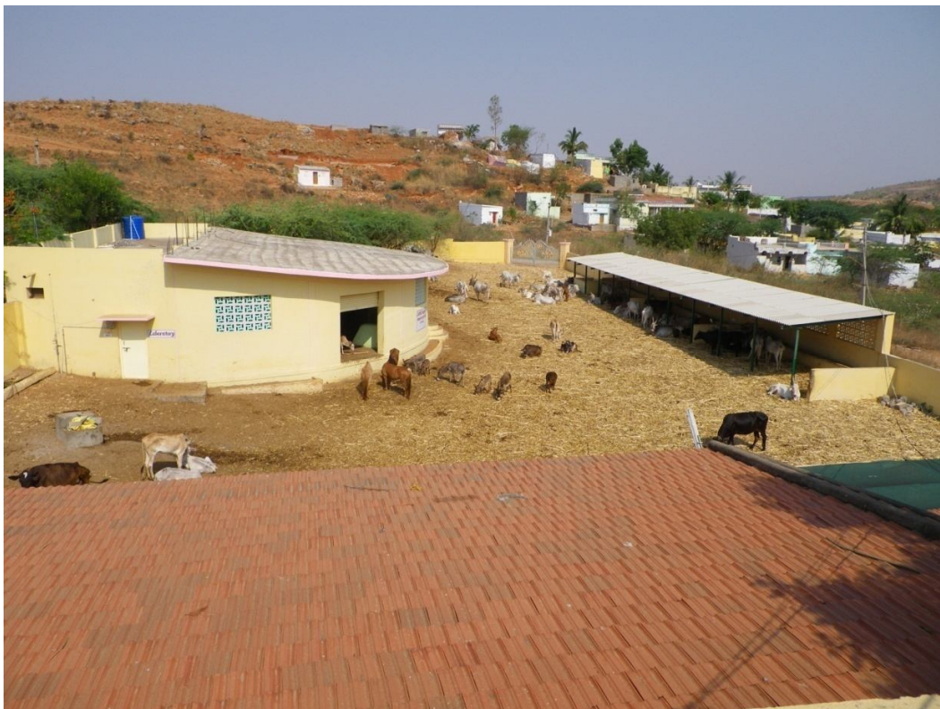
OUR CATTLE HOSPITAL AT THE OUTSKIRTS OF ENUMULAPALLI

The development of the Ahimsa Farm is still in progress with our efforts to get the electricity connections. Only after the infrastructure has improved can we think about expanding our agriculture and shifting our wildlife rescue centre.