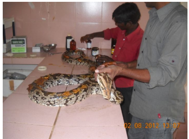
RELEASED AFTER TREATMENT