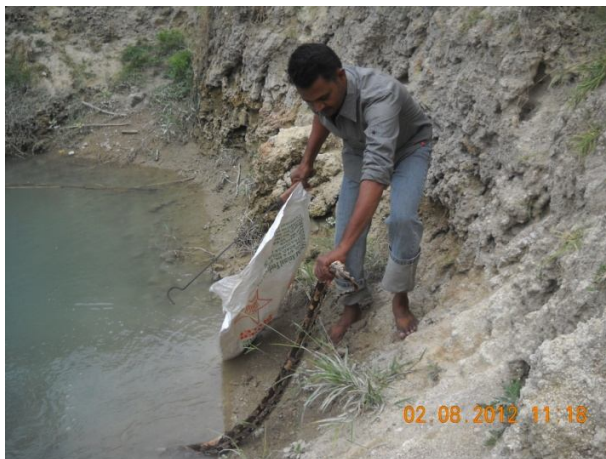
PYTHON RESCUED FROM A WELL