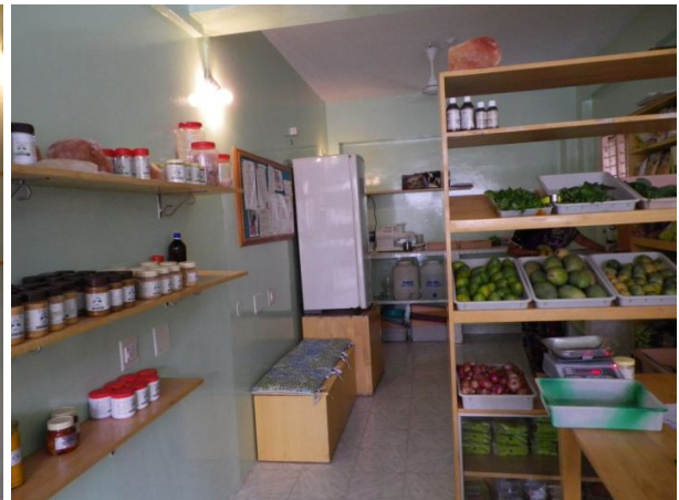
KARUNA SHOP IN PUTTAPARTHI