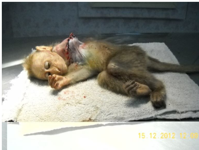
BELLA HAD THE LEFT ARM CUT OFF, AFTER SURGERY SHE RECOVERED