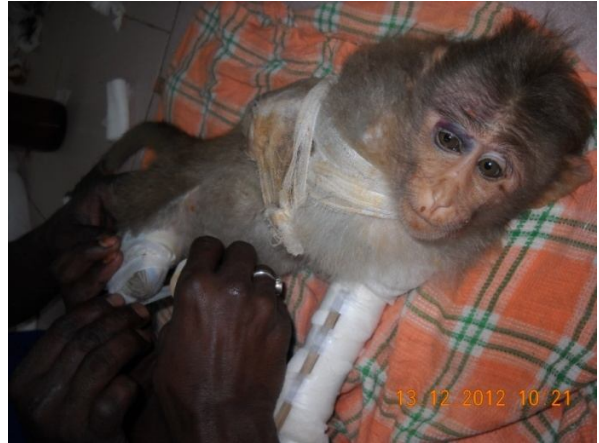
THE MONKEY DID NOT SURVIVE