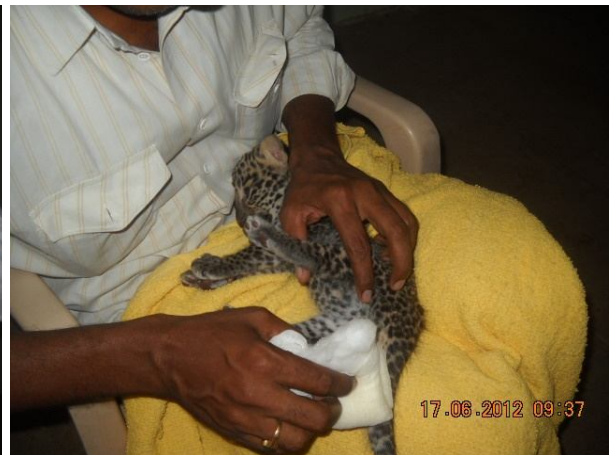
RESCUED PANTHER CUB