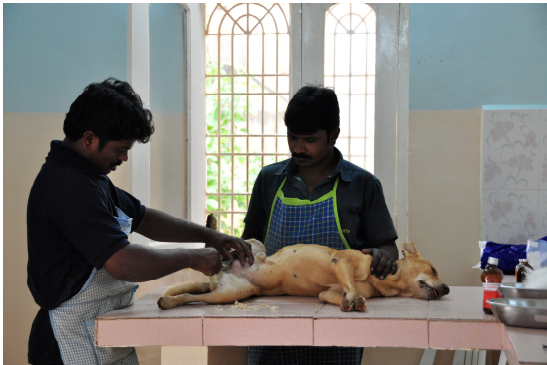
shaving before surgery

For the last few years, we have not applied for any ABC grant from AWBI as the compensation for the work is insufficient, the procedures have changed and there is little or no support from the municipalities and local administration. This has forced us to continue the surgeries only for Puttaparthi and surrounding villages with the help donations to create a safe area for the visiting devotees and ashram.