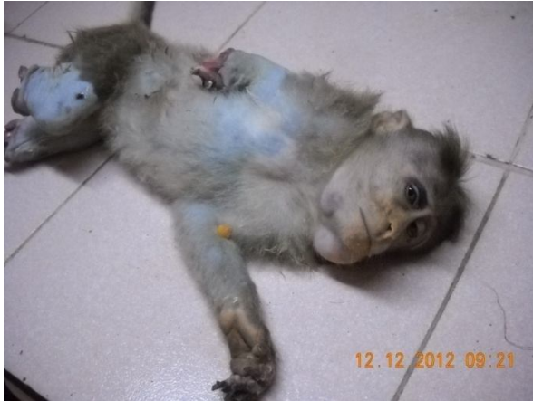
THREE LEGS CUT OFF

In a small town in Anantapur District, Andhra Pradesh, India, a group of monkeys were brutally butchered as they were considered a nuisance in the town. Two survivors, an adult and a very young one, were brought to the Karuna clinic by some caring villagers. The adult monkey had three legs cut off and the small one lost its left arm. (We wrote a report to the authorities) It was heartbreaking to see their suffering.